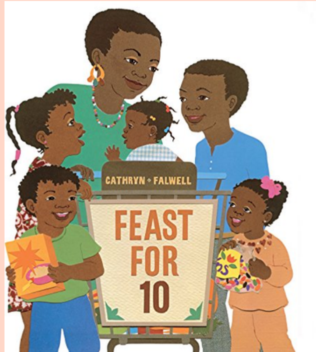
Feast For 10 By: Cathryn Falwell

This counting book will encourage children to count and want to do it over and over again! Shopping, cooking, setting the table... Everyone in this family wants to pitch in to help make their feast enjoyable.